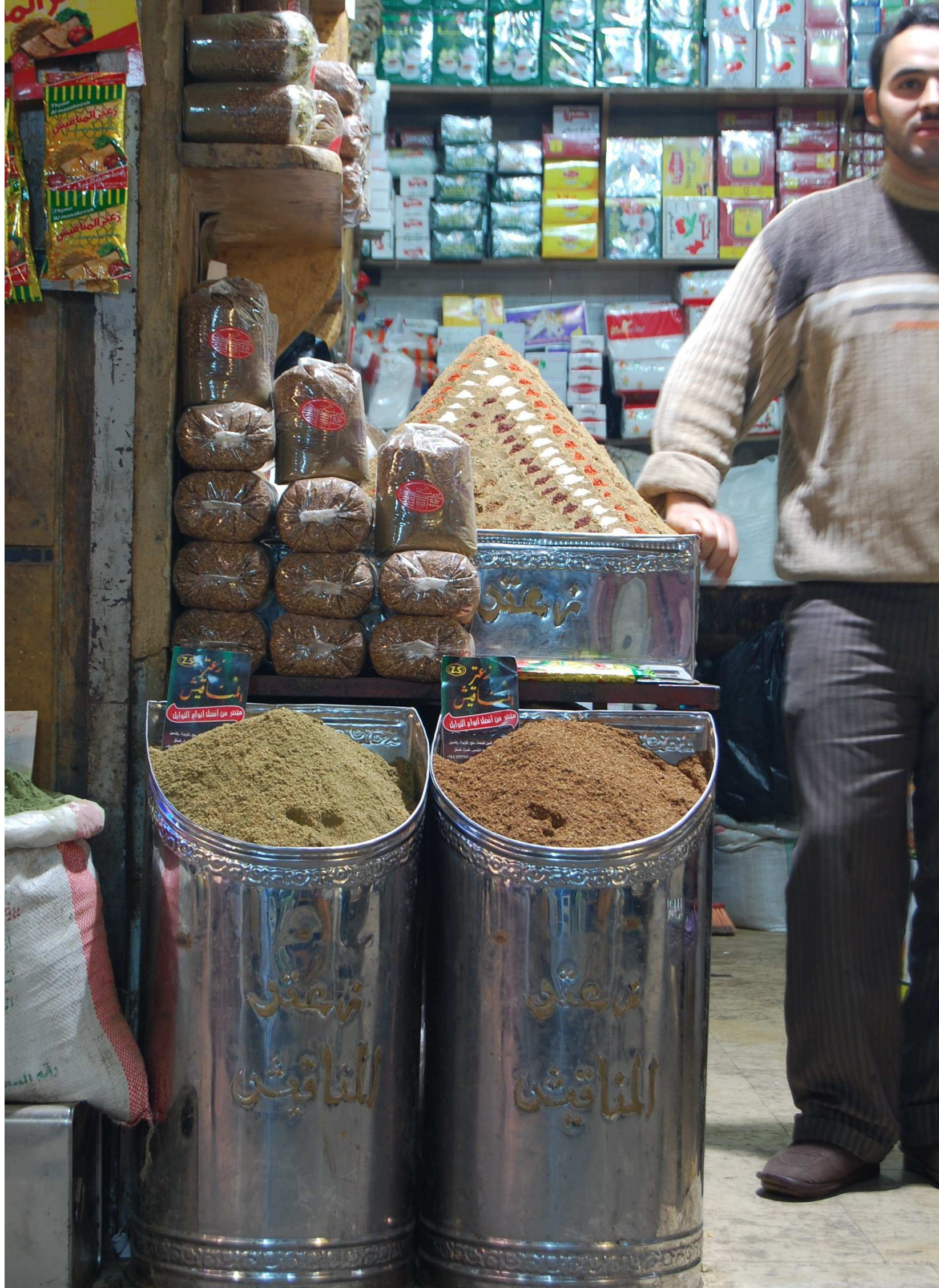
Syria, Alep, 2010 previous page: New York, 2003 next page: Syria, Alep, 2010