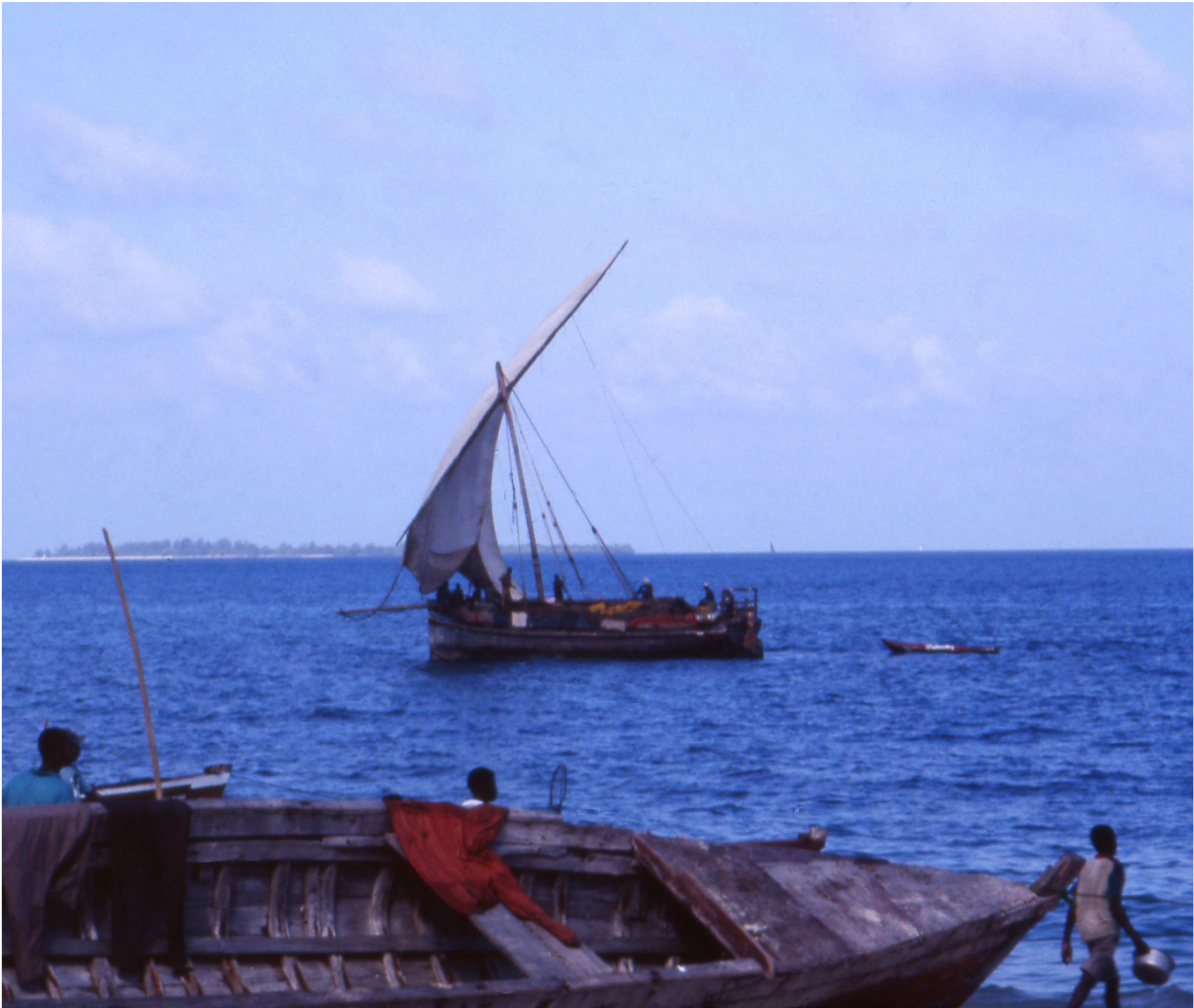
Tanzania, Dar es Salam, 1997 next page: Mexico, San Cristobal de las Casas, 2000 both next pages: India, Varanasi, 1985