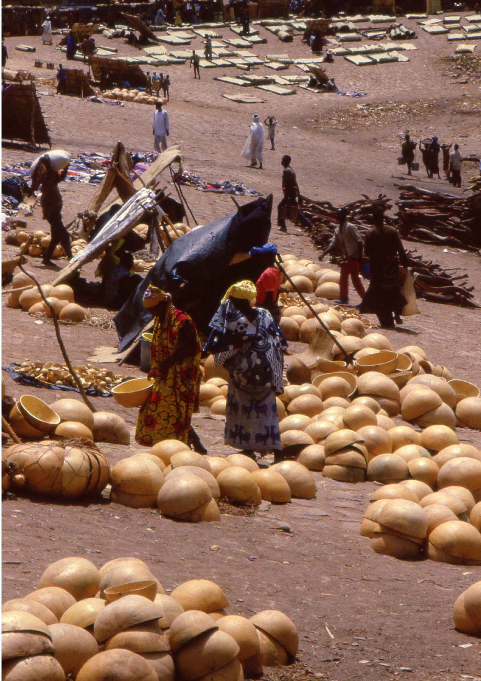
Mali, Mopti, 1989 previous page: Mali, Bandiagara, 1989 next pages: left-left: Mongolia, Erden Zuu, 1999 left-right: Libya, Gadames, 2011 right: Mexico, San Cristobal de las Casas, 2000