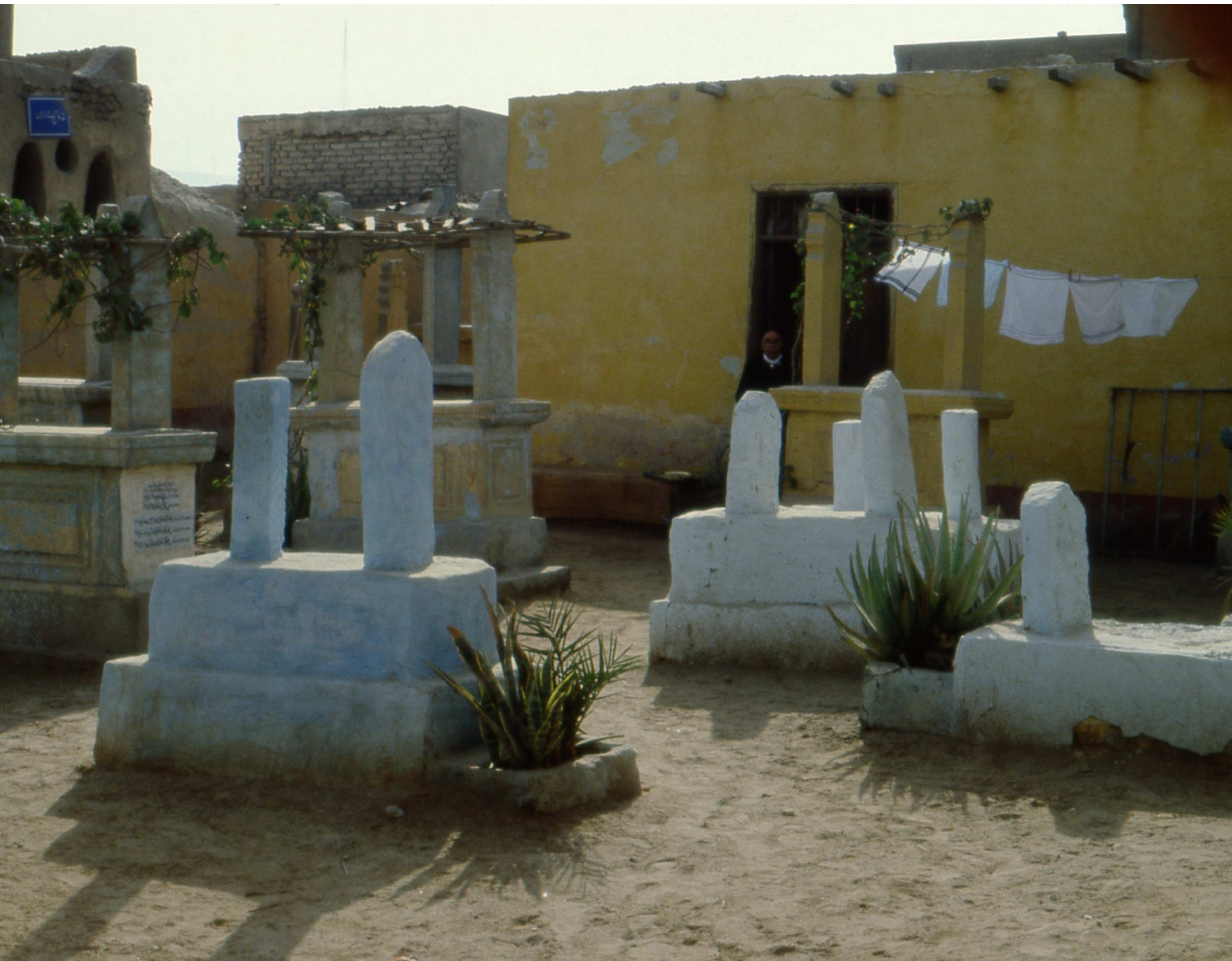
Egypt, Cairo, 1983 previous page: up: Mongolia, Ulan Batar, 1999; down: Egypt, Ghiza, 1983 next pages: left: Nicaragua, Leon, 2006; right: Armenia, Yerevan, 2012