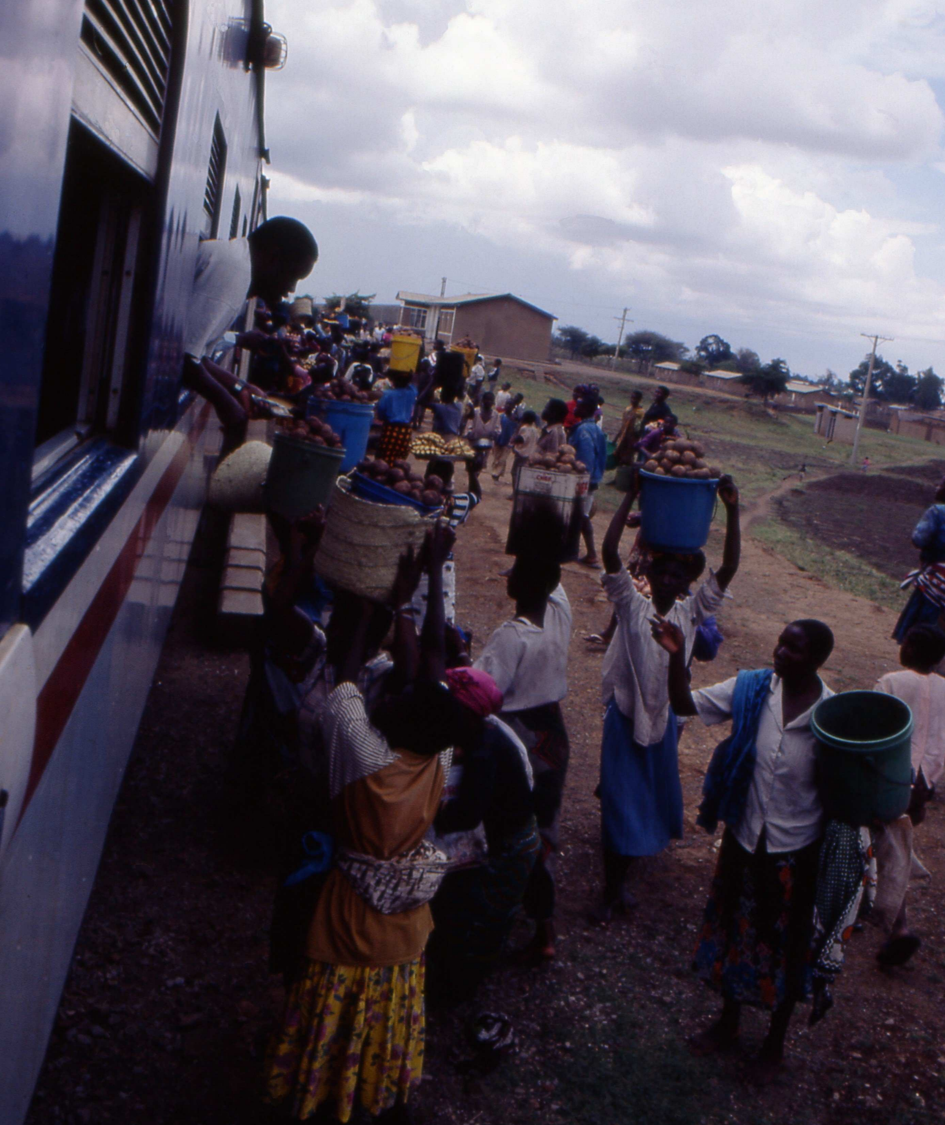
Tanzania-Zambia, TAZARA railway, 1997 next page, both: Mali, Bandiagara, 1989 previous pages: left-up: Armenia, Goris, 2012 left-down: India, Jaisalmer, 1985 right: India, Jaisalmer, 1985