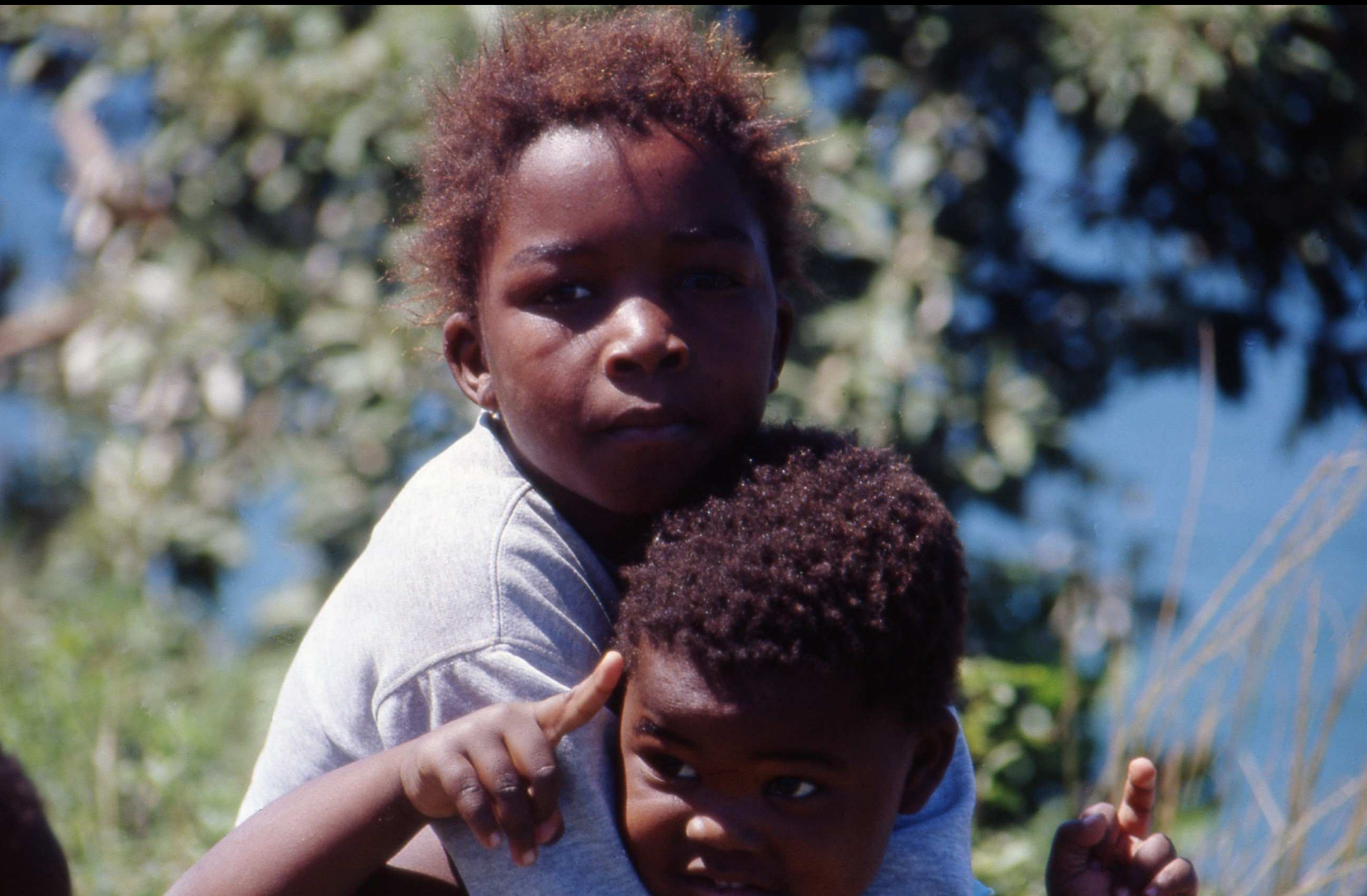
South Africa. Wild Coast, 2007 up: Tunisia, Kairouan, 1985 next page: Mali, Niger river, 1989