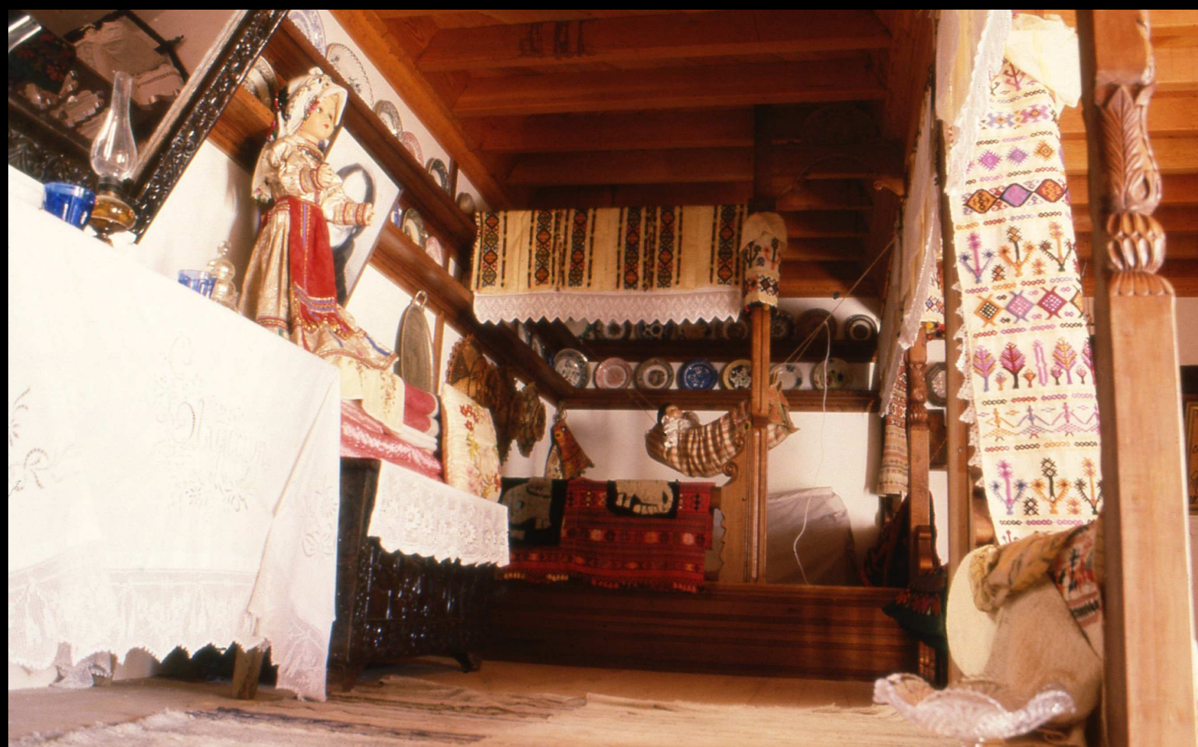
Greece, Lindos, 1988 up; same location previous page: up: Libya, Leptis Magna, 2010 down: Greece, Pavliani, 1986 next pages: left: Greece, Alonissos, 1986 right: India, Goa, 1985