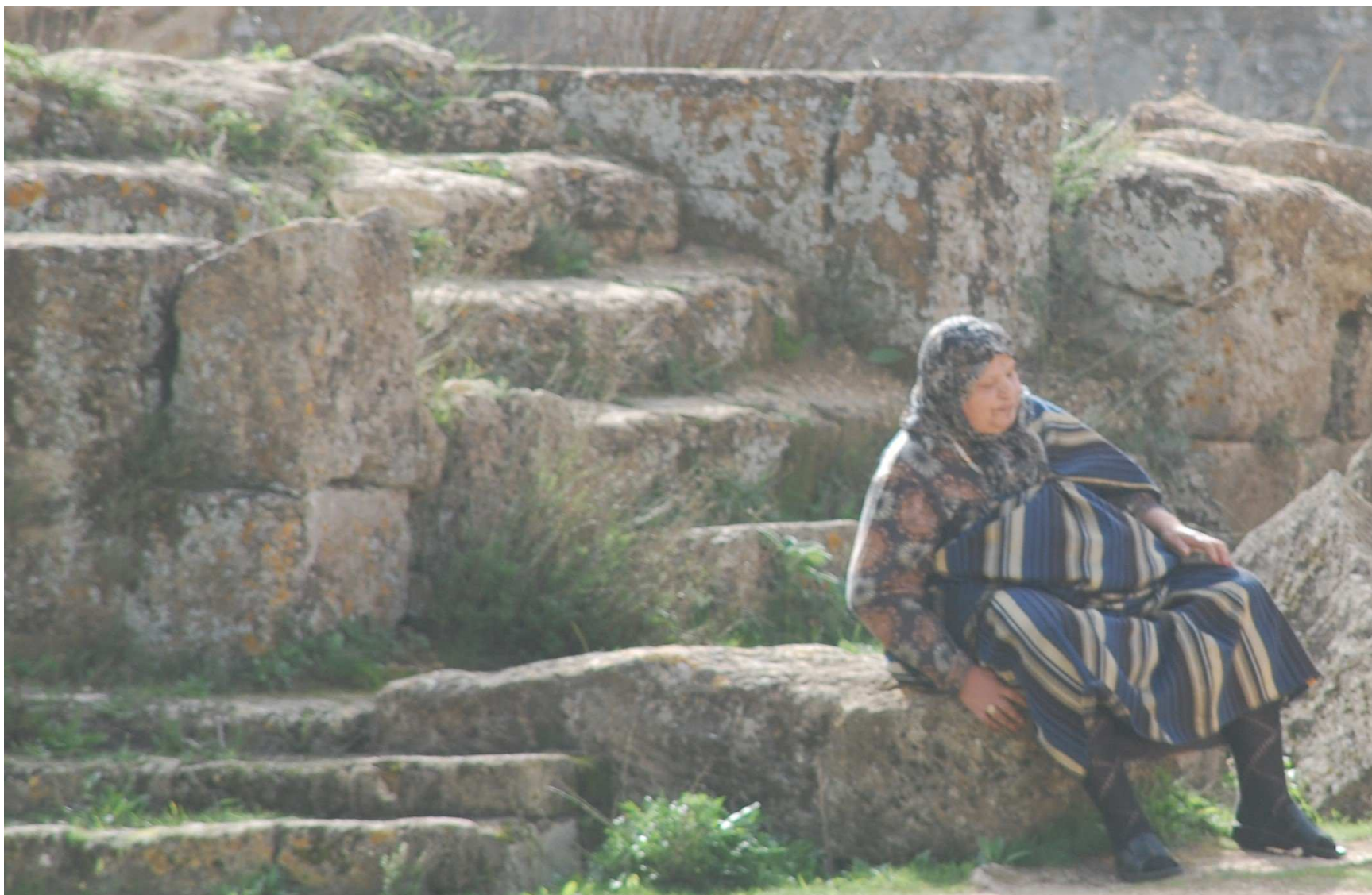
Libya, Cirene, 2010 up: Greece, Cefalonia, 1979 next page: Greece, Kastelorizo, 1988 next pages: left: Greece, Corfu, 1984 right: Greece, Alonissos, 1986