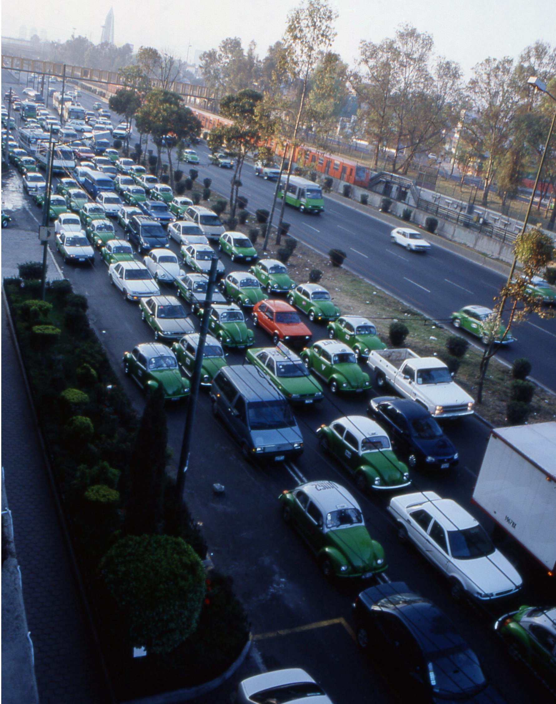
Mexico, Mexico City, 2000 previous page: up: Australia, Outback, 2003 down: Tanzania, Zanzibar, 1997 next pages: left: Armenia, Goris, 2012 right: Egypt, Tobruk, 2010