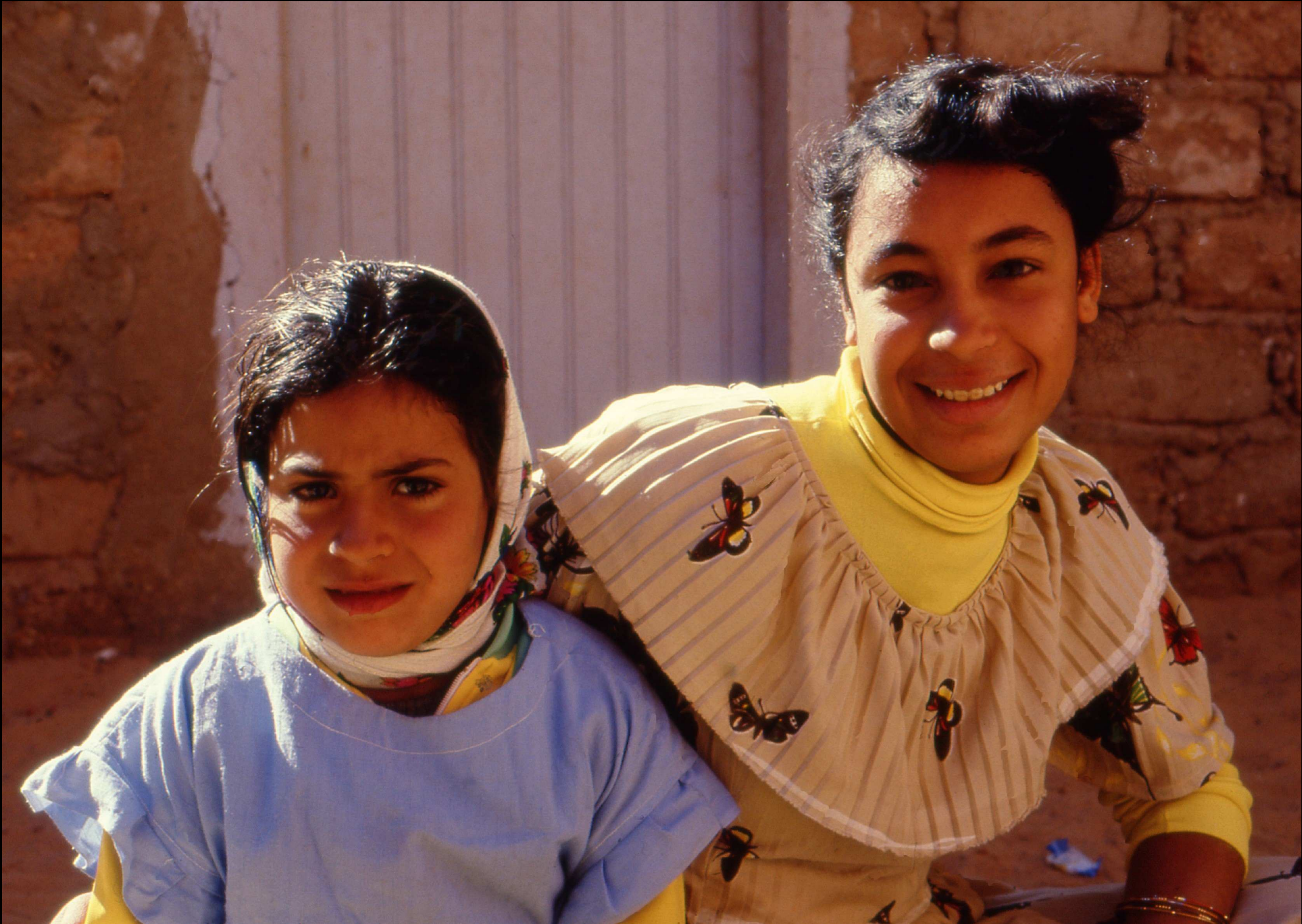
Algeria, Timimoun, 1987 next page: UK, London, 1984