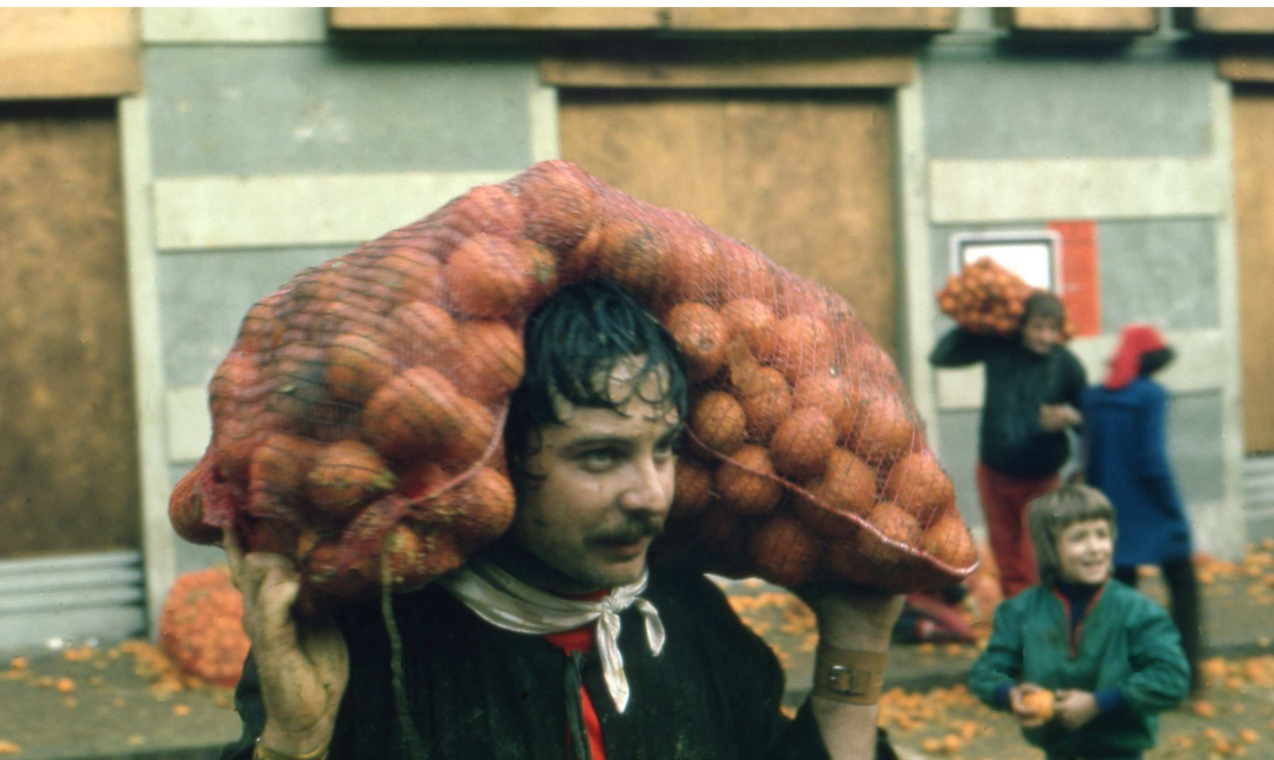
both pages: Italy, Ivrea, 1981 next pages: left: Italy, Ivrea, 1981 right: Argentina, Buenos Aires, 2013