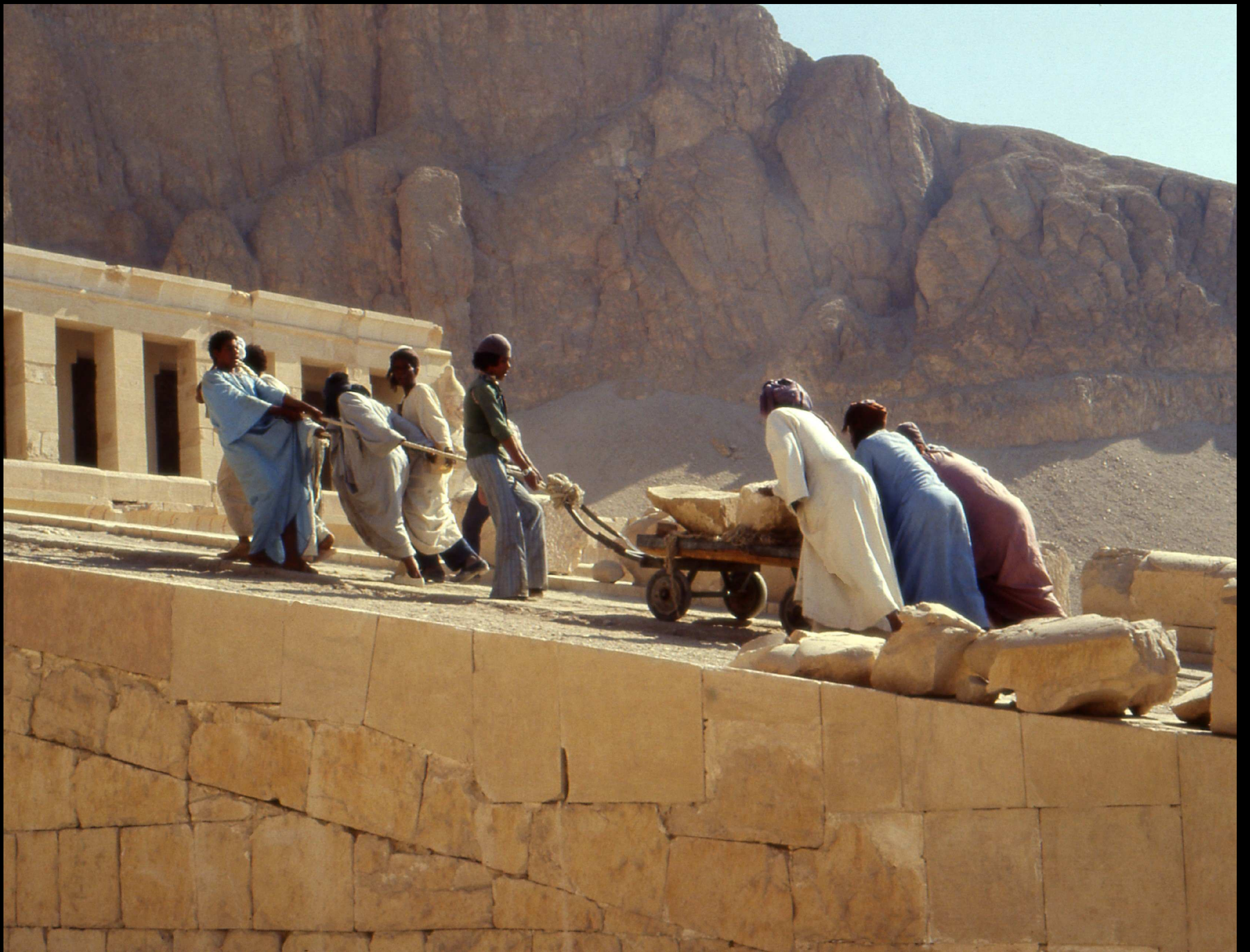
Egypt, Hatsepsut Temple, 1983 previous page: India, Varanasi, 1985 next pages: left: Mali, Niger river, 1989; right: Algeria, Abalesa, 1986