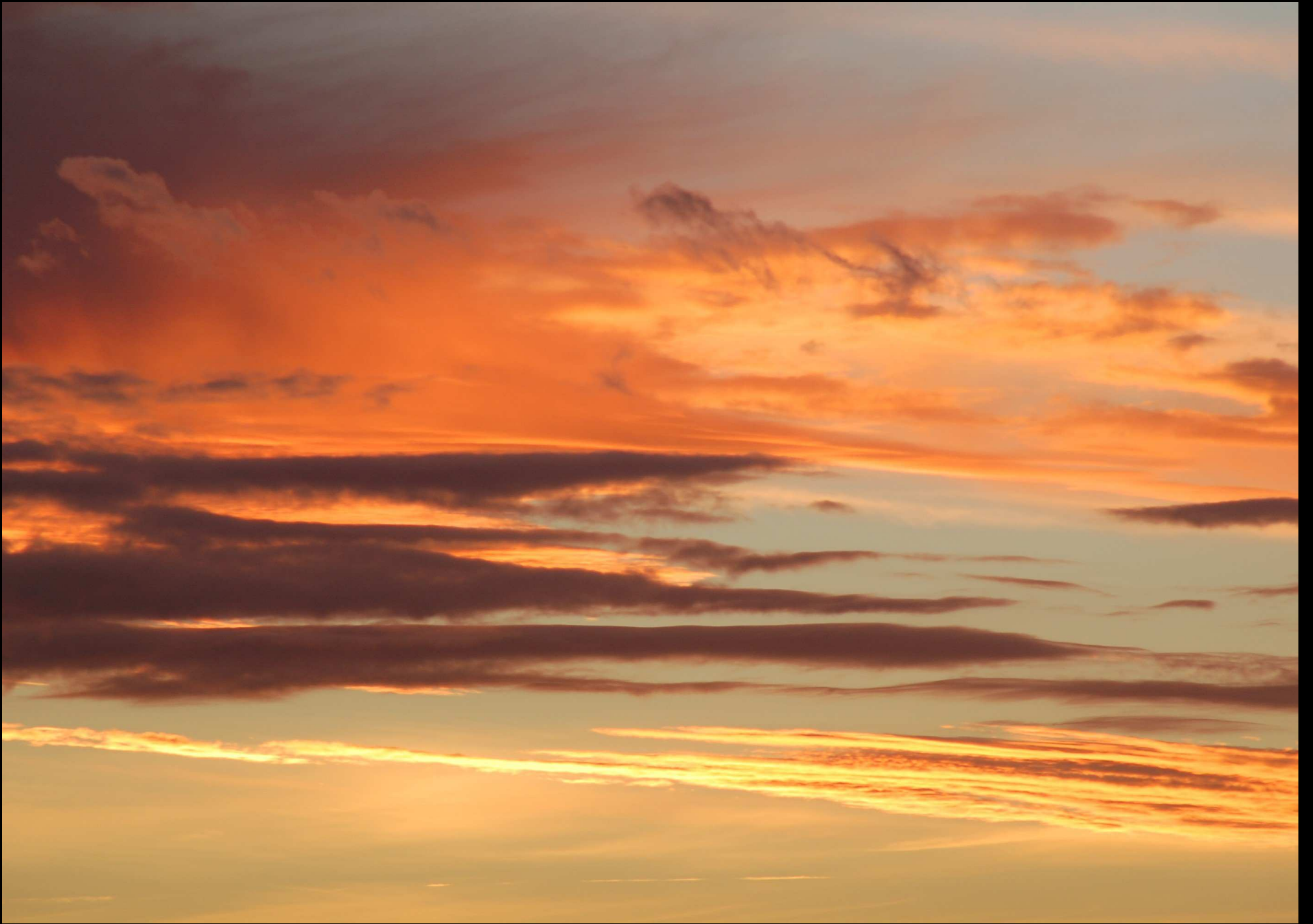
New Zealand, Hawke's bay, 2008 Next page: Argentina-Chile, Magelan's straight, 2013