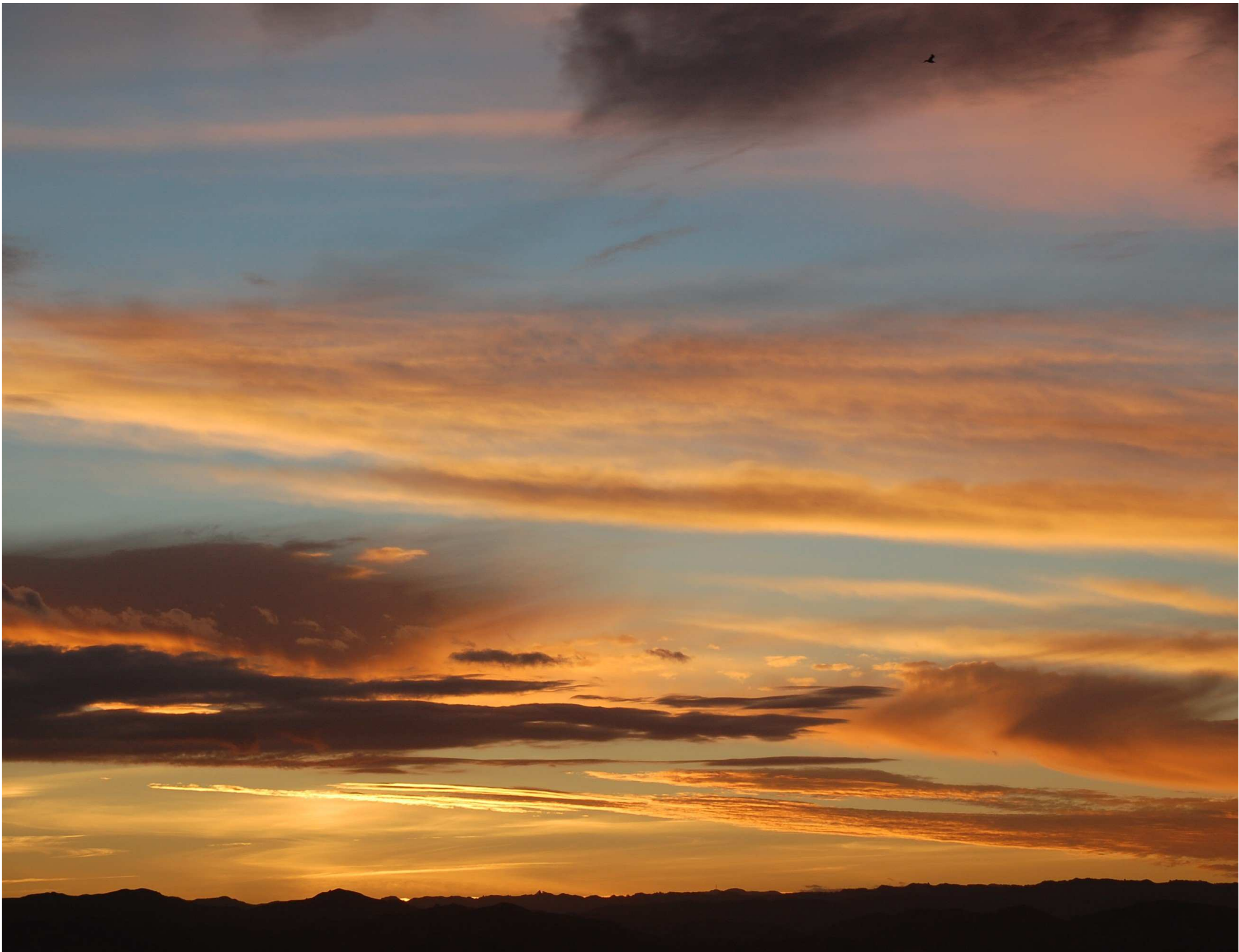
This page, next page and the previous two pages: New Zealand, Hawke's bay, 2008