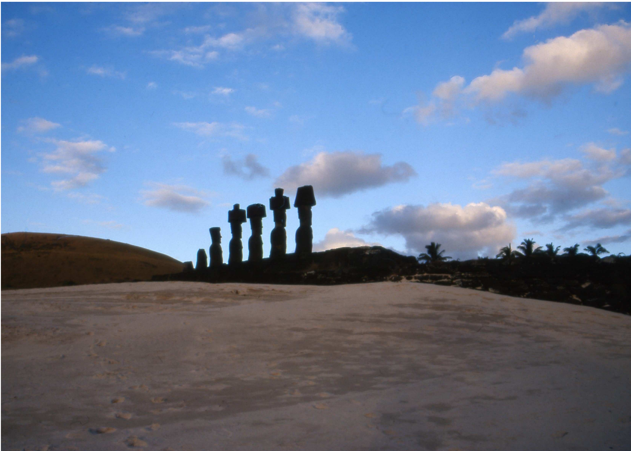
Rapanoui, 2003 previous page: same location next page: same location