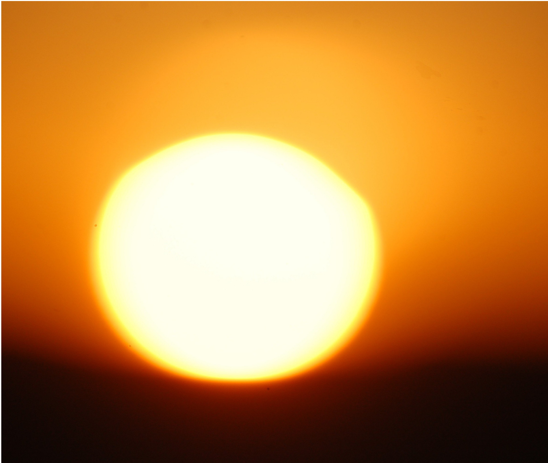
This and next double page: Libya, Sahara desert, 2011 Previous page: up: Libya, Sahara desert, 2011; down: Sirya, Euphrates river, 2010