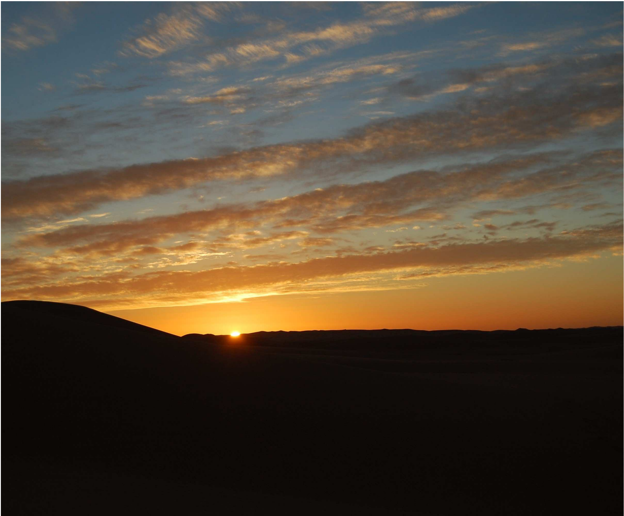
Libya, Sahara desert, 2011 Next page: up: Greece, Agrafa, 2010; down: Greece, Lake Plastira, 2010